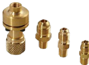
VPAS8 ANTI-SIPHON VALVE KIT 3/8" SAE female knurl nut