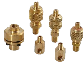
VPASU ANTI-SIPHON VALVE KIT 1/4" SAE, 3/8" SAE, 1/2"-20 UNF female knurl nut