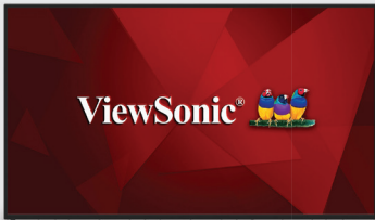
▶ ViewSonic CDE6512 65" commercial display