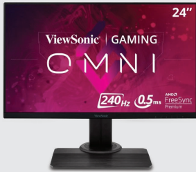
▶ ViewSonic XG2431 24" 1080p IPS gaming monitors