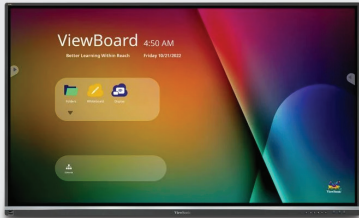
▶ ViewSonic ViewBoard IFP7550 75" interactive display