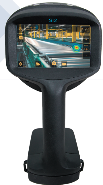
FLIR Si2-Pro Acoustic Imager

The key to overcoming these challenges lies in adopting advanced fault detection technology, such as acoustic imaging, that allows for early-stage identification of critical issues. As a recent inspection performed at a metalworking facility indicates, the FLIR Si2 acoustic camera equipped with market-leading technology was able to identify critical faults in machinery components. Not only did the camera findings confirm suspicions about known issues within the conveyor system, but it also uncovered a significant fault that led to a drive coupling failure between an electric motor and pump just a few days after the inspection. The metalworking company representatives were especially impressed with the snapshots taken of