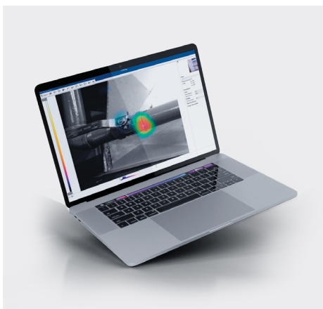
Machine learning-powered analytics provide data-driven decision support on the Acoustic Viewer and FLIR Thermal Studio.

the detected faults with the acoustic camera, which they found extremely helpful and easy to interpret. Utilizing the decision support provided by the FLIR Si2 acoustic camera, a plan was immediately put in place to replace various chains and bearings.