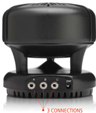
3 CONNECTIONS Microphones, projectors or computers