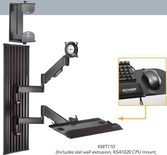
KWT110 (Includes slat wall extrusion, KSA1020 CPU mount, KWG110 Dual Arm Mount, KWK110 Keyboard Mount)