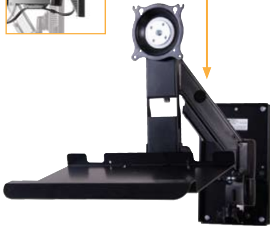
KWGSK Steel Stuf Monitor Mount and KSA1021 Keyboard Tray Accessory (sold separately)