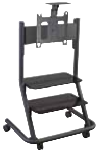
PPCU Mobile Cart, Single Monitor