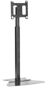
PF1U Display Stand, Single Monitor