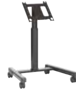
PFMU Confidence Cart, Single Monitor