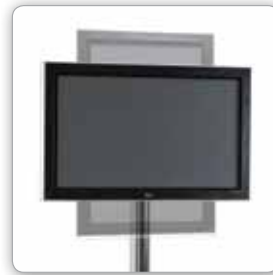
Portrait/Landscape Display Positions