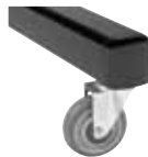
PAC775™ Outdoor Casters