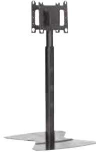
PF2U Display Stand, Dual Monitor