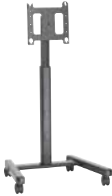
PFCU Mobile Cart, Single Monitor