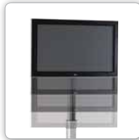
Telescoping Height Adjustment