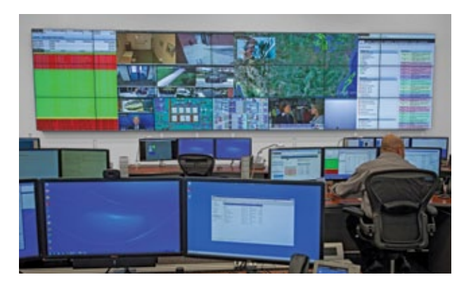
American Water's control room display wall comprises 21 ultra-narrow bezel LCD flat panels from Christie.