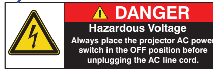
Danger Hazardous Voltage