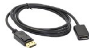
^ DisplayPort male to DisplayPort cable