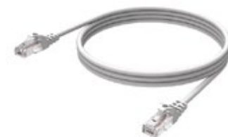
^ Ethernet 1.5m cable

For the most current specification information, please visit christiedigital.com