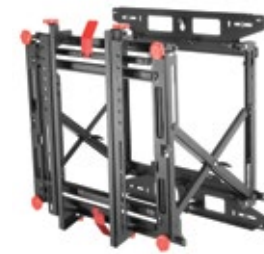
^ Christie full-service video mount (MPL15 portrait/landscape)

Contact your Christie representative for a customized bundle.