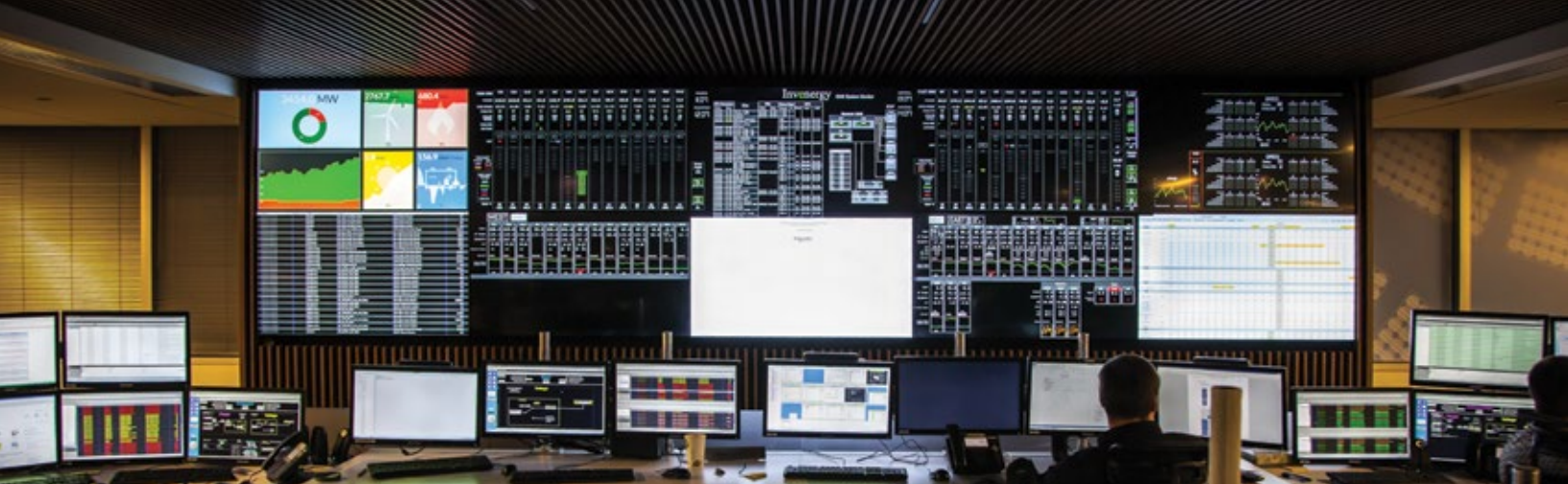
▲ A Christie LCD video wall and Christie Phoenix content management system powers the control room at Invenergy's Chicago headquarters.