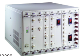
19200 Matrix Scanning System Sentinel III