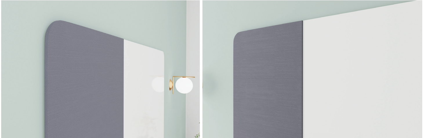
Rounded corners detail