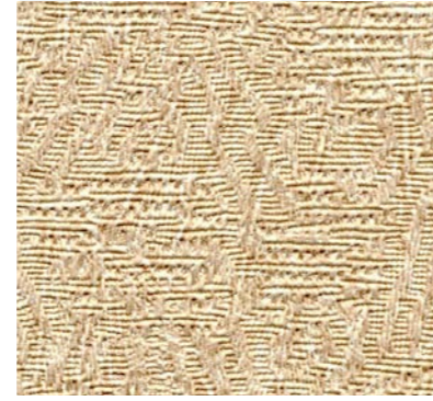
KV241 WHEAT STRAW