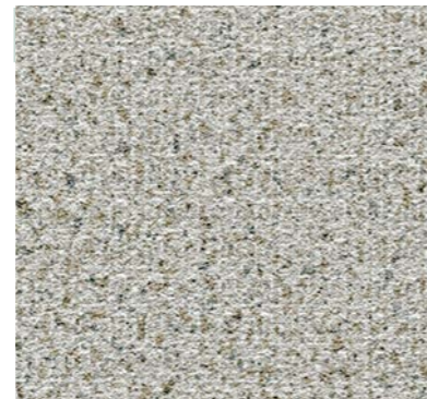
KE592 GENTLEMAN GREY