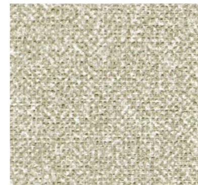
KL483 DOWNING STONE