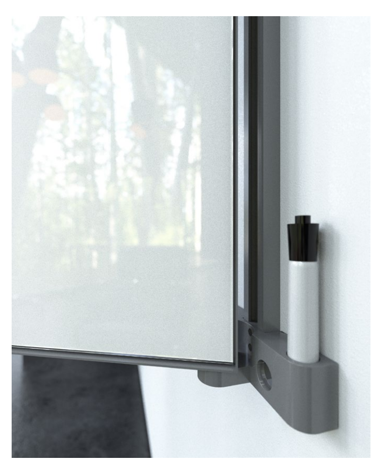
The patented design of Flip features self-leveling hardware and magnets. That means your board will fit snug to your wall, even if it is hung on an uneven surface.