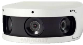
PanaCast® 2 Camera