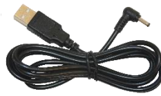
Power Adapter Cable (1.5m)