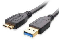
USB 3.0 Cable (1m)