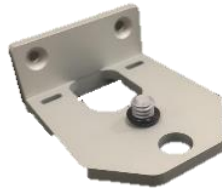
Wall Mount (optional)