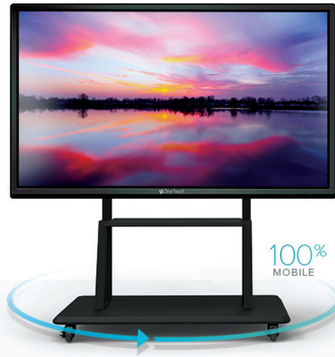
Fixed Mobile Stand