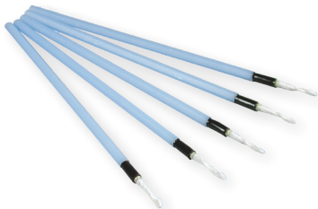
Type 1.25 mm