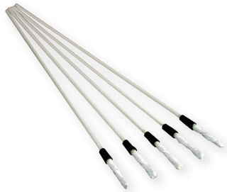
Type 2.5 mm