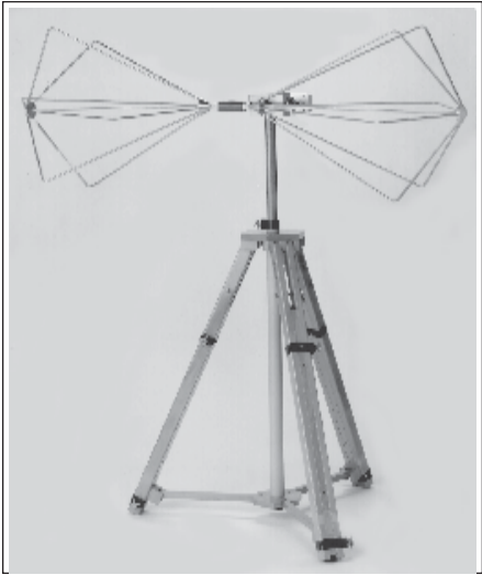
Figure 1.1 Biconical Antenna (w/ tripod AT-100)