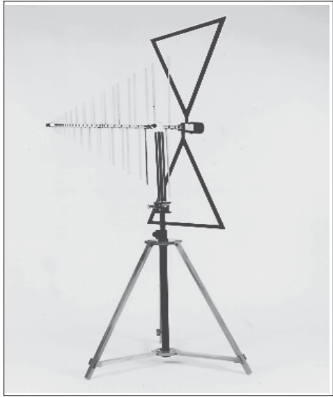
Figure 1-1. Combilog mounted on AT-100 tripod.