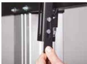
Pull & release locking brackets for easier mounting of display