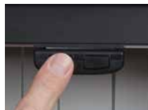
Wired remote control included