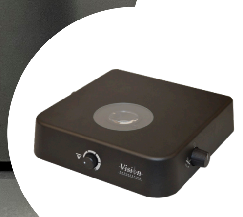
Contrast Enhancing Base