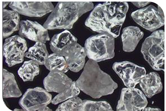
Sugar crystals under EVO Cam II (100x magnification)