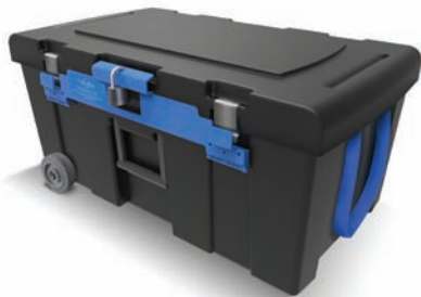
Locked tub with woven nylon pull-handle and built-in wheels