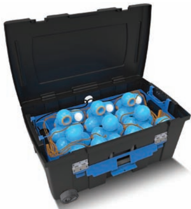
Includes 2 x 6 outlet USB hubs for charging robots