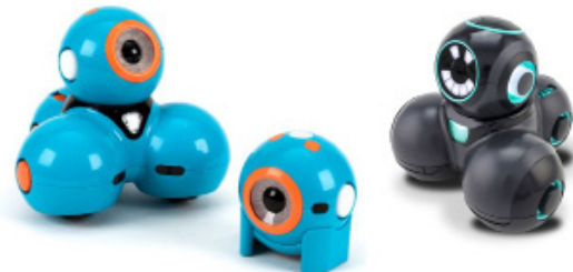
Tub stores 6 Dash and 6 Dots, or 12 Dashes (with accessories), or 12 Cue™ Robots.

For further details, please visit our website or contact Customer Service. www.copernicused.com 1 800 267 8494