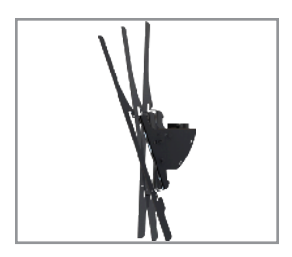
0 to +20° tilt for optimal viewing angles.