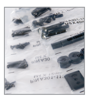
Mounting Hardware Complete set of screen mounting hardware, labeled for ease of use and ready to go.