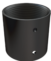
EC1: Pipe Connector