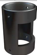
EC2: Pipe Connector with Opening for Cord Management