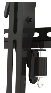
One touch lock and key system for added security