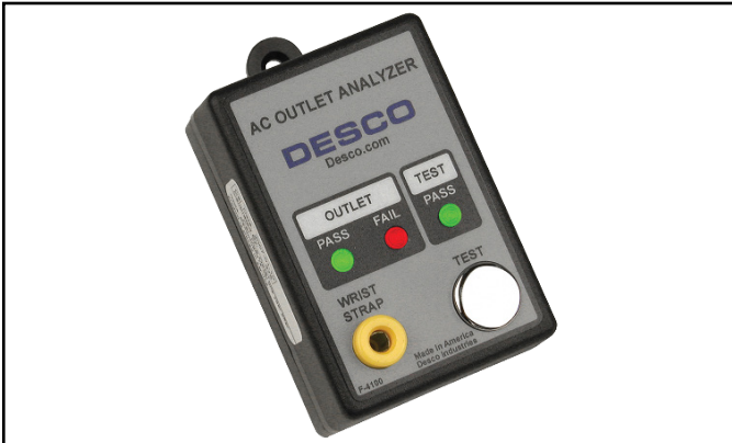
Figure 1. Desco 98132 AC Outlet Analyzer and Wrist Strap Tester