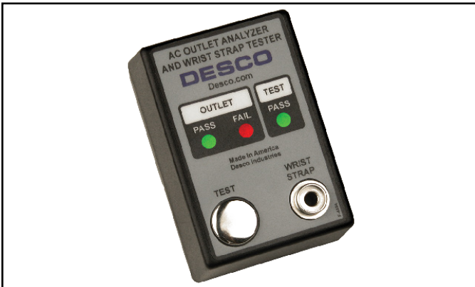
Figure 2. Desco 98131 AC Outlet Analyzer and Wrist Strap Tester

Use the AC Outlet Analyzer and Wrist Strap Tester to fulfill the S6.1 Section 6.3.1 requirement. “The hot, neutral, and equipment grounding conductor shall be verified to be in the proper wiring orientation in accordance with the National Electric Code (ANSI/NFPA-70).” (Grounding ANSI/ESD S6.1 section 6.3.1 Equipment Grounding Conductor)