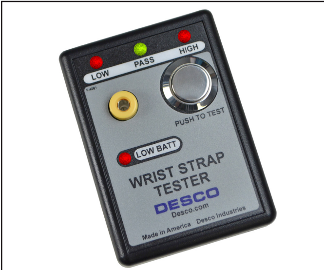
Figure 1. Desco 19240 Portable Wrist Strap Tester