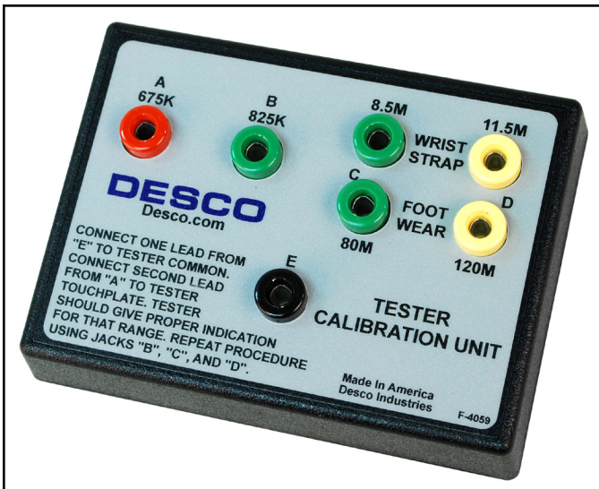
Figure 3. Desco 07010 Calibration Unit

View technical bulletin TB-2039 for more information.