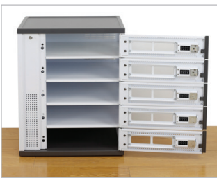
Five bays support up to 15 devices