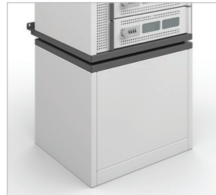
The Charging Locker Pedestal accessory elevates the Charging Locker off the floor by 18" (45 cm) making it easier to reach the bays (#98-137-A68)