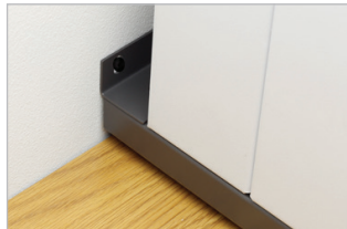
A bracket attaches Charging Locker to wall or desktop for added security