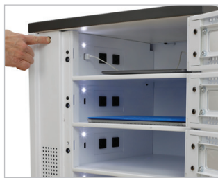
All bays light up with a simple push of a button