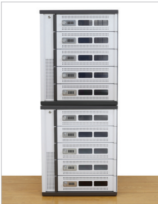
Stack and secure two lockers together to save space