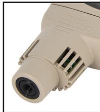
PosiTector DPM IR includes an infrared surface temperature probe