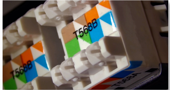
360 Viewer (View Objects at a 35 Degree Angle)