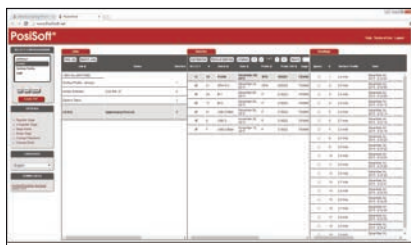
Jobs Batches Readings