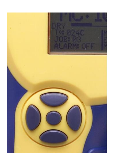
Fig. 1 Keypad Layout