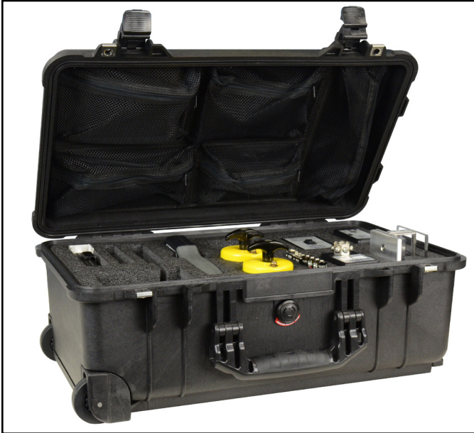
Figure 1. Desco 19790 ESD Survey Kit