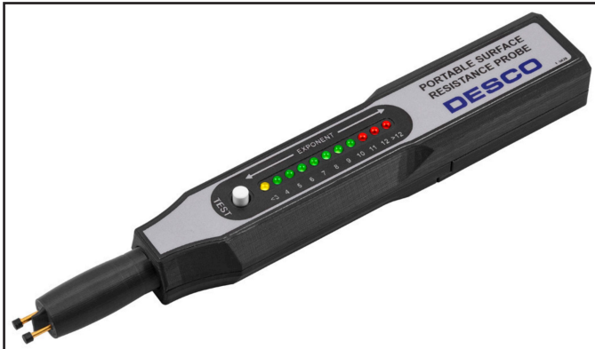
Figure 1. Desco 19301 Portable Surface Resistance Probe