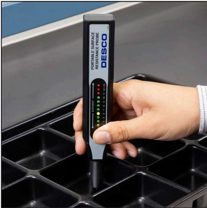
Figure 4. Using the Portable Surface Resistance Probe