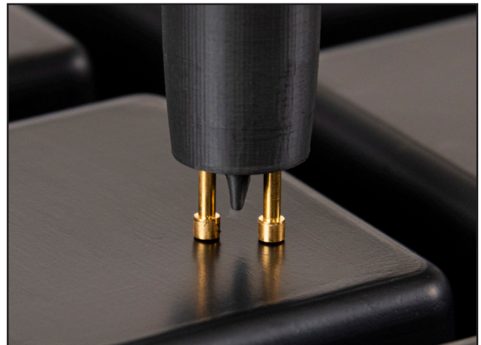
Figure 2. Orienting the spring-loaded pins onto the material to be tested