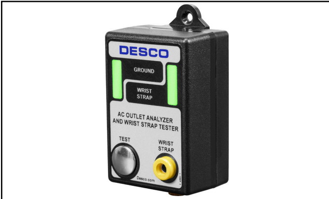
Figure 1. Desco 98133 AC Outlet Analyzer and Wrist Strap Tester