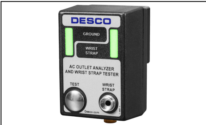
Figure 2. Desco 98134 AC Outlet Analyzer and Wrist Strap Tester

Use the AC Outlet Analyzer and Wrist Strap Tester to fulfill the S6.1 Section 6.3.1 requirement. “The hot, neutral, and equipment grounding conductor shall be verified to be in the proper wiring orientation in accordance with the National Electric Code (ANSI/NFPA-70).” (Grounding ANSI/ESD S6.1 section 6.3.1 Equipment Grounding Conductor)