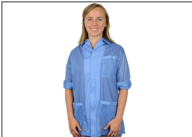
Figure 1. Desco Statshield® Smocks with Convertible Sleeves and Snaps Cuffs.