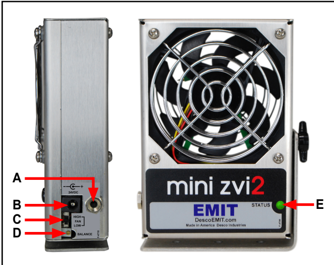
Figure 3. Mini Zero Volt Ionizer 2 features and components

A. Ground Jack: Insert the banana plug end of the included ground cord to this jack. Connect the ring terminal end of the cord to equipment ground.