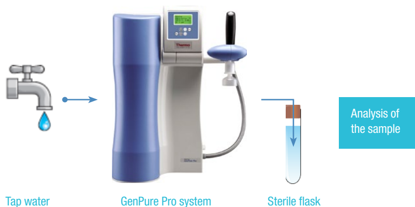
Figure 2. Diagram of the set-up for the GenPure Pro water system being fed tap water