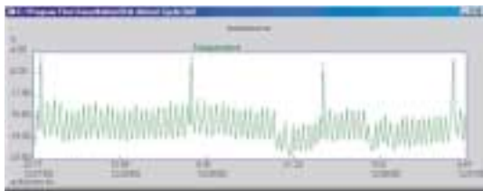
Refrigeration Defrost Cycles