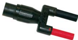
Banana (female) - BNC (male) Adaptor Catalog #2118.46 (optional)

*These two models are specifically designed to be used with recorders or power analyzers with a Voltage AC input. A scale factor may need to be entered into the recorder to display the exact value.