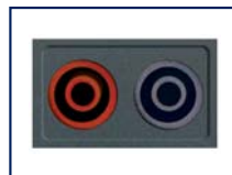
Jacks: Two standard safety banana jacks (4mm)