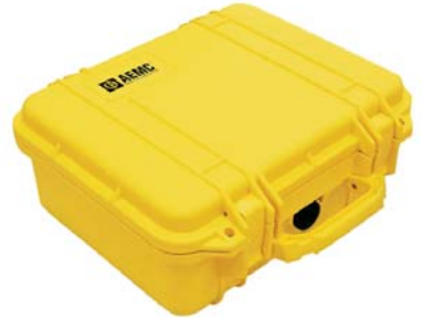
Field Case for use with all models Catalog #2118.98