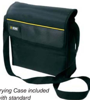
Soft Carrying Case included with standard megohmmeter models Catalog #2119.02