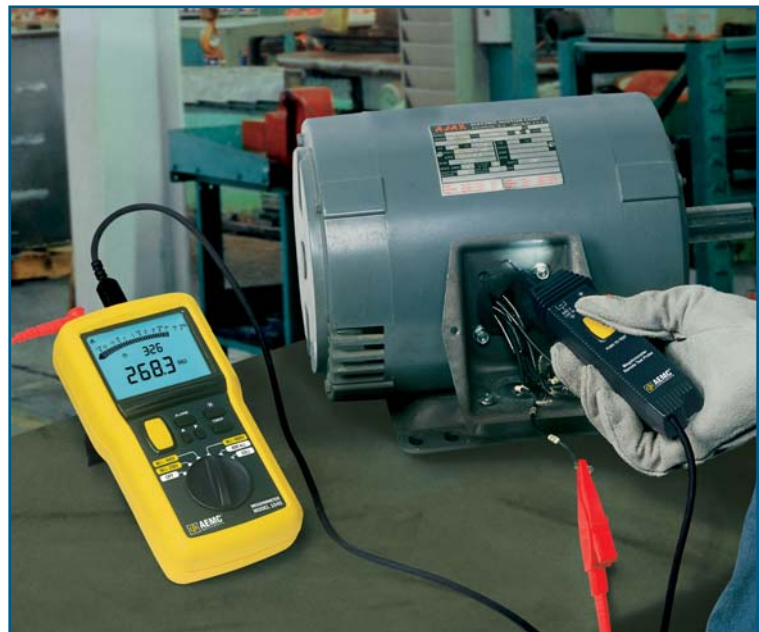
Remote probe used with Model 1045 to initiate a test at the motor. Target light provides good visibility of test area.