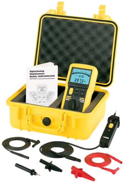
Field Kits Model 1040 Kit, Catalog #2117.30 Model 1045 Kit, Catalog #2117.31