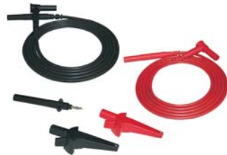
Test Leads standard with all models Catalog #2119.01