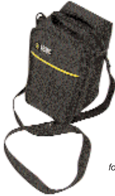
Hands-Free Carrying Case for use with all models Catalog #2118.99