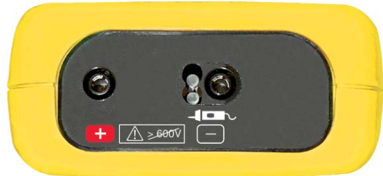
Models 1040 & 1045