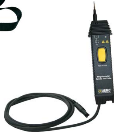
Remote Test Probe for use with Models 1040 & 1045 Catalog #2118.97