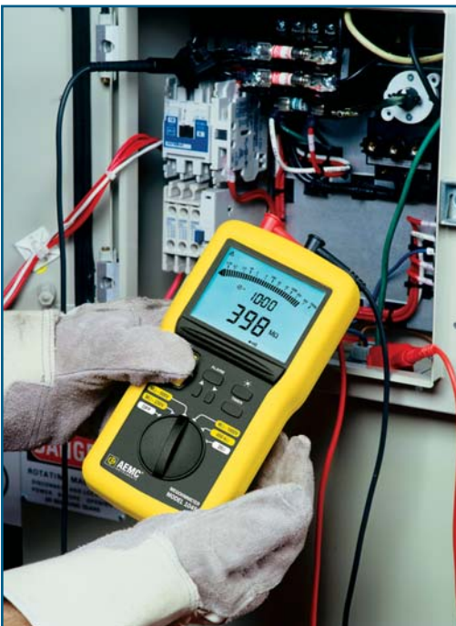
Easy-to-read digital/analog display (backlight on)