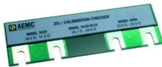
25Ω Calibration Checker Catalog #2118.58