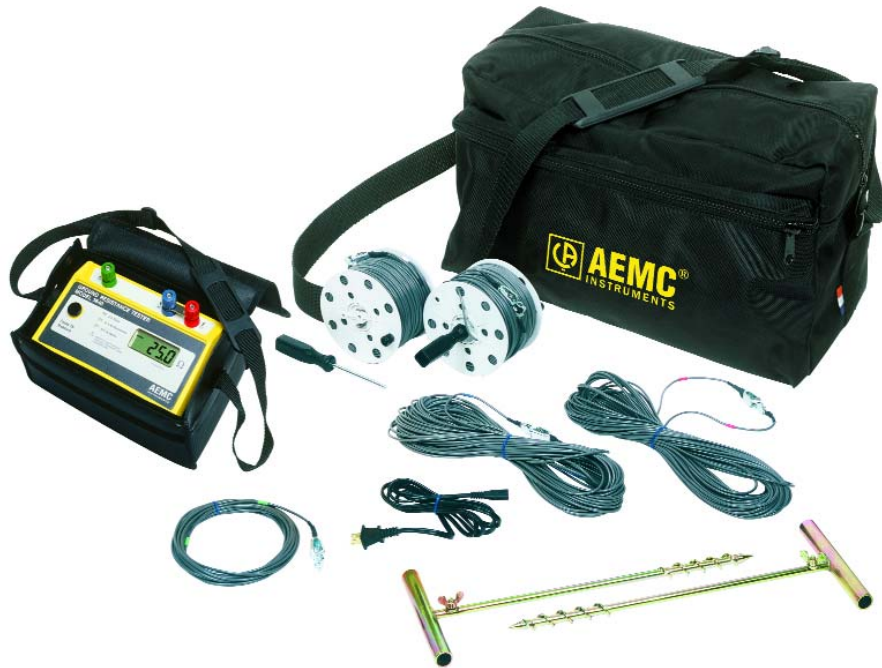
Digital Ground Resistance Tester Model 3640 Kit Catalog #2114.93