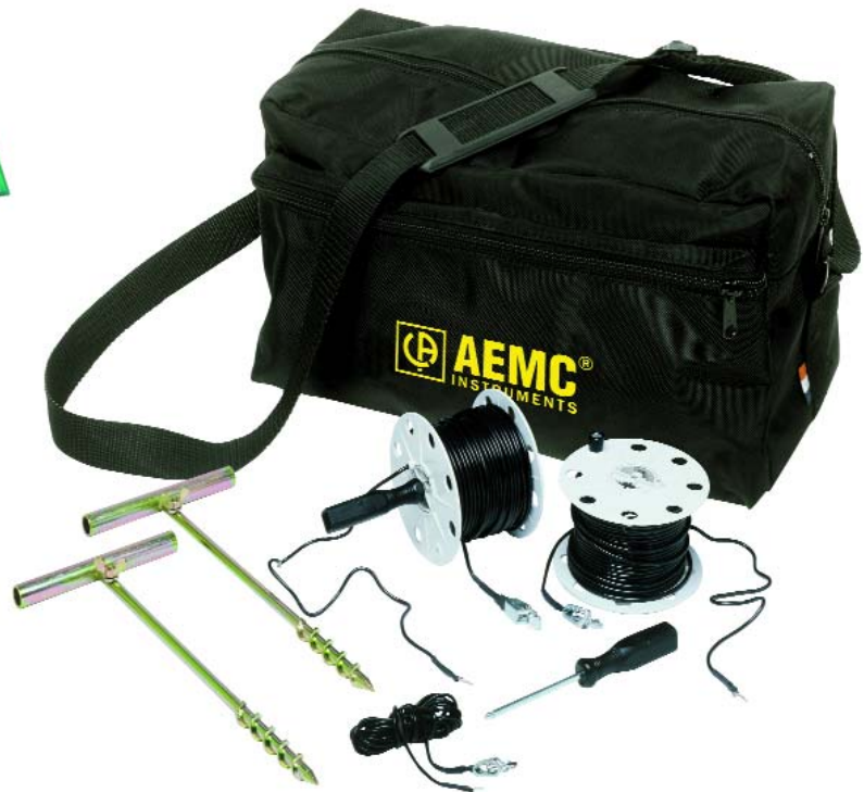
Test Kit for Model 3640 includes one 16 ft lead, two 150 ft leads on spools, two wind-up handles, two auxiliary ground electrodes and molded hard carrying case with slot for meter Catalog #2114.96