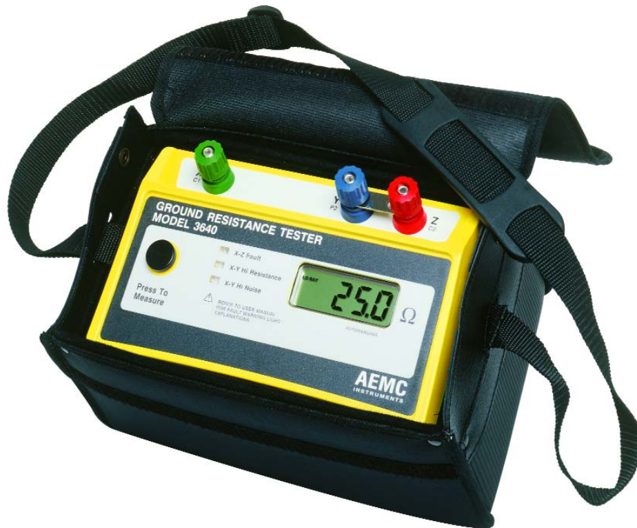
Model 3640 shown in standard soft carrying case Catalog #2114.92