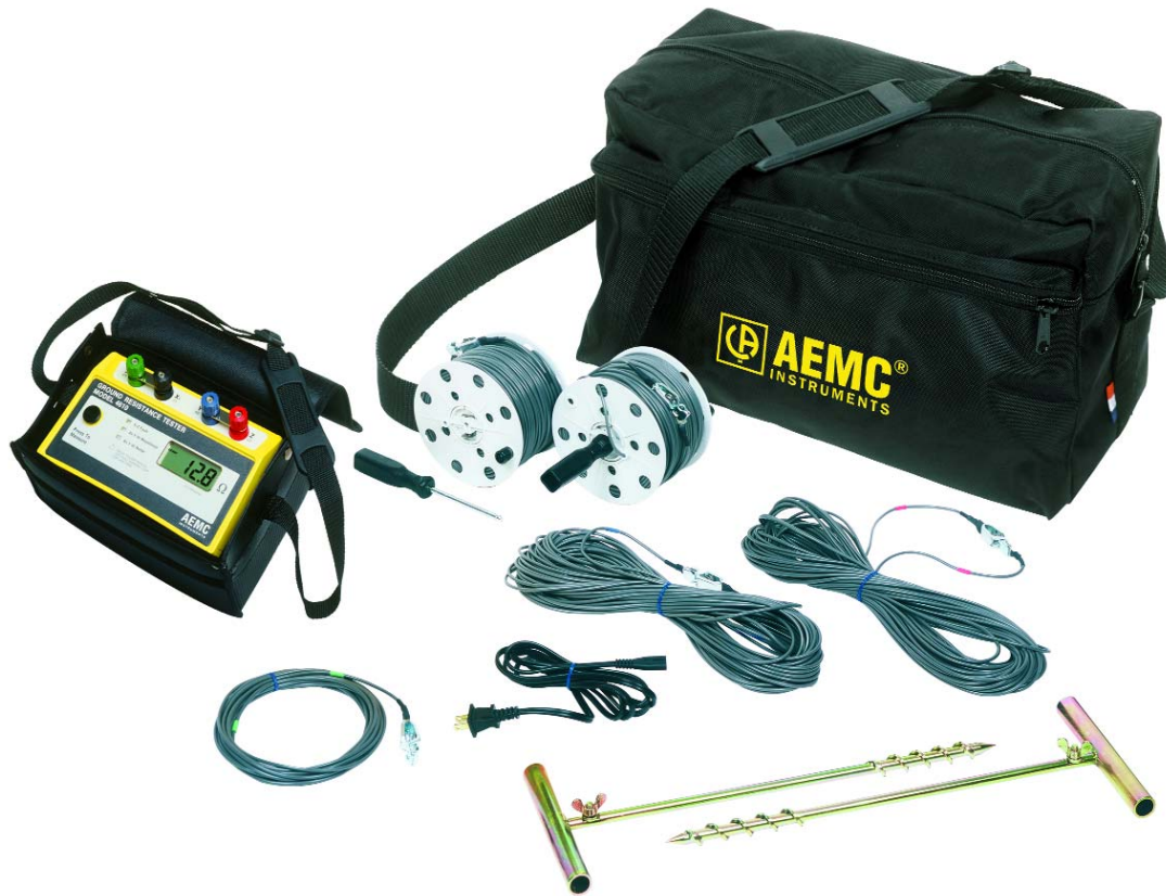
Model 4610 Kit (optional) Catalog #2114.95