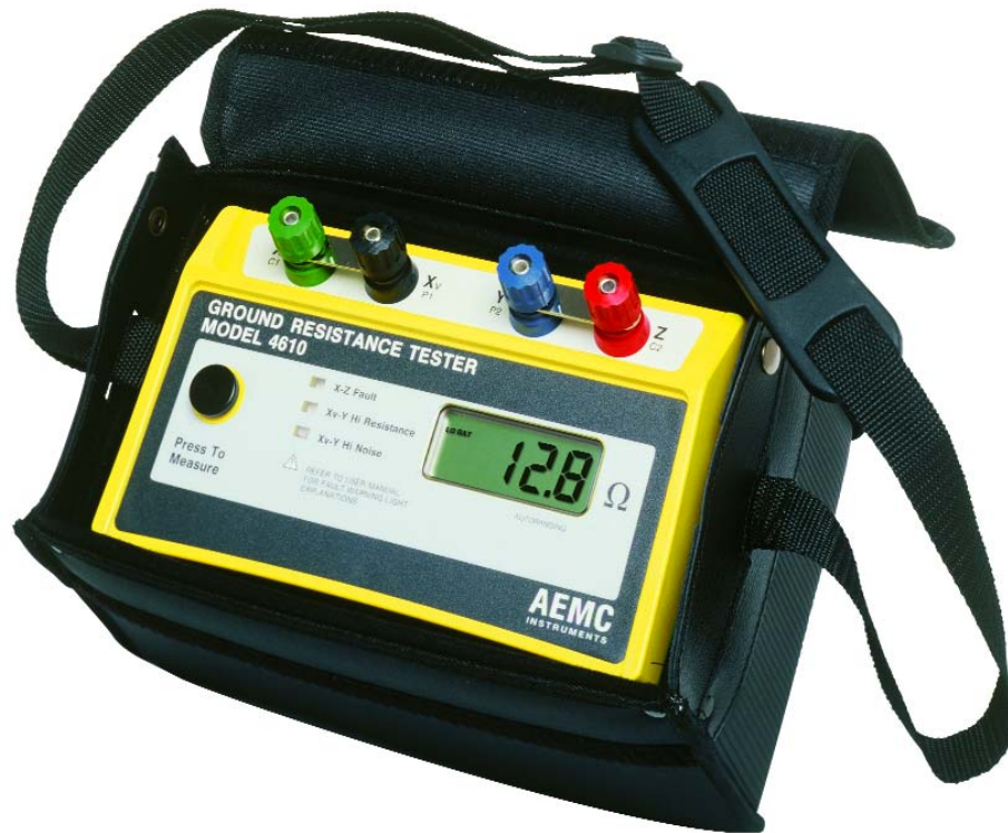
Model 4610 shown in standard soft carrying case Catalog #2114.94