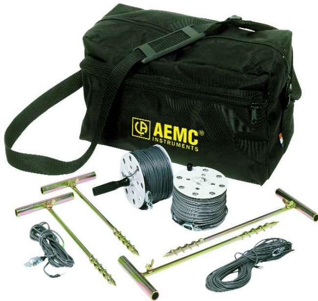
Test Kit for Models 4600 & 4610 includes four auxiliary ground electrodes, two 300 ft leads on reels with wind-up handles, one 90 ft lead and one 16 ft lead in hard carrying case (Catalog #2118.31)