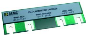
25Ω Calibration Checker Catalog #2118.58