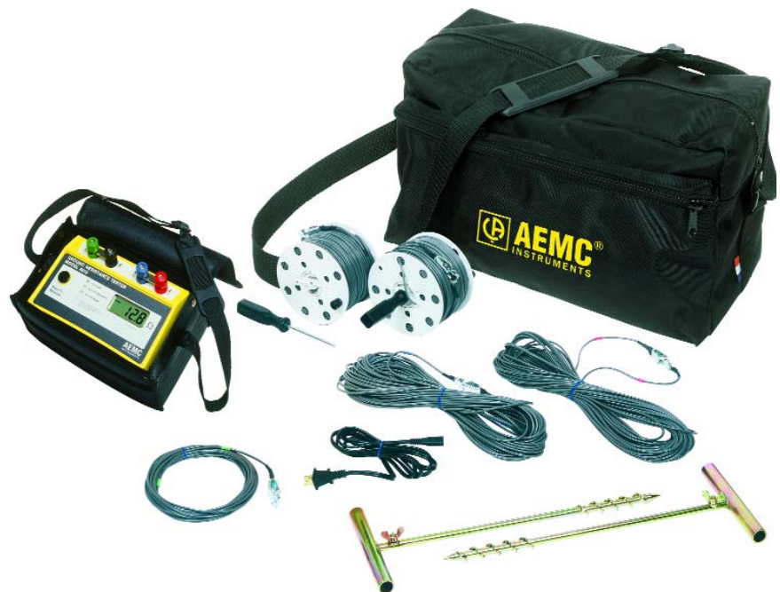
Digital Ground Resistance Tester Model 4610 Kit (Catalog #2114.95)