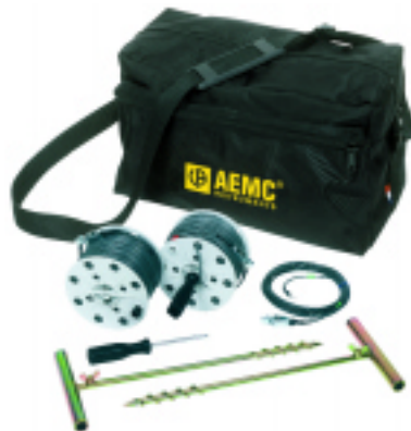
Test Kit – 3-Point includes carrying bag, two 150 ft color-coded leads on spools, two 16" auxiliary ground electrodes, one 16 ft lead with Mueller® clip and one 100 ft tape measure Catalog #2130.62