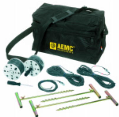
Test Kit – 4-Point includes carrying bag, two 300 ft color-coded leads on spools, two 100 ft color-coded leads, four 16" auxiliary ground electrodes, one 16 ft lead with Mueller® clip and one 100 ft tape measure Catalog #2130.63