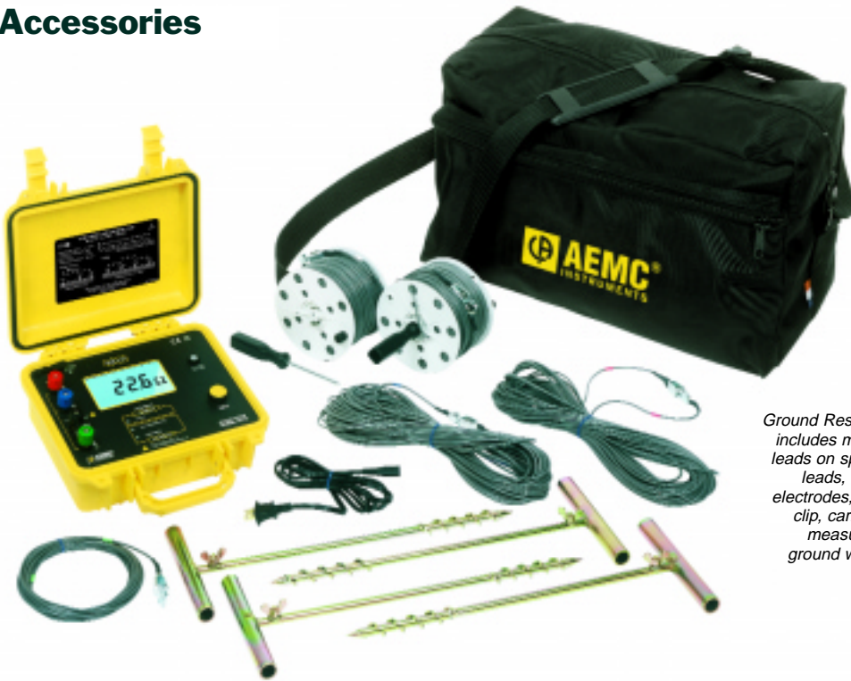
Ground Resistance Tester Model 4630 Kit includes meter, two 300 ft color-coded leads on spools, two 100 ft color-coded leads, four 16" auxiliary ground electrodes, one 16 ft lead with Mueller® clip, carrying bag, one 100 ft tape measure, one AC power cord, ground workbook and user manual