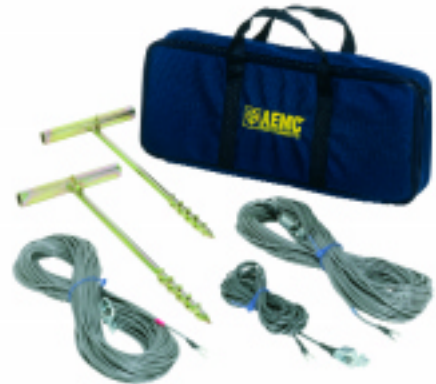
Ground Test Kit – 3-Point (supplemental 4-Point) includes carrying bag, two 100 ft color-coded leads, one 16 ft lead and two 16" auxiliary ground electrodes Catalog #2130.61