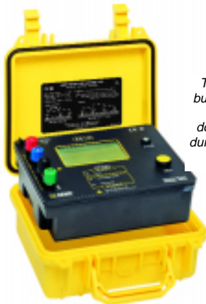
The Models 4620 and 4630 are built into a double case. This extra rugged construction provides double insulation, maximum field durability and ease of serviceability.