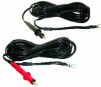
Kelvin probes, 10A, 20 ft spring loaded Catalog #2118.52