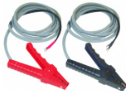
Kelvin clips, 10A set of two Catalog #1017.84