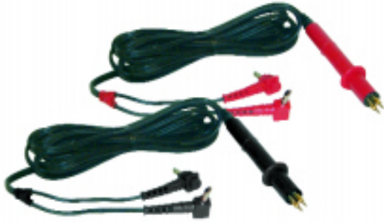
Kelvin probes, 10A, set of two Catalog #1017.82