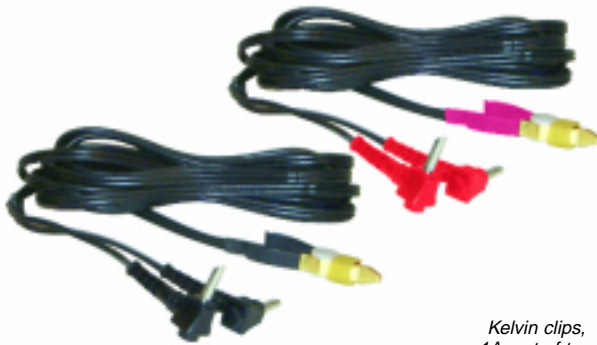
Kelvin clips, 1A, set of two Catalog #1017.83