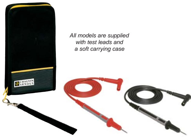
All models are supplied with test leads and a soft carrying case