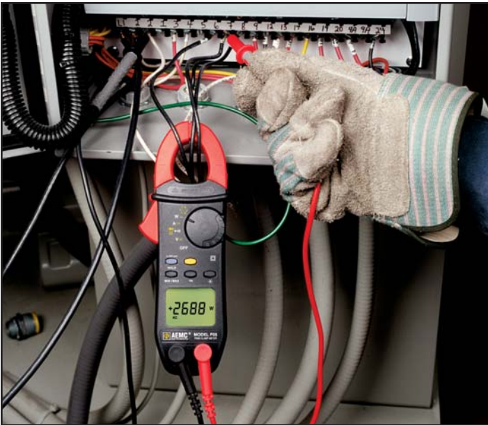
Model F05 monitoring volts, amps and watts on a control panel.