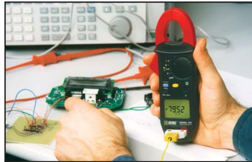
Model F03 measuring temperature on electronic circuit board using a K thermocouple.