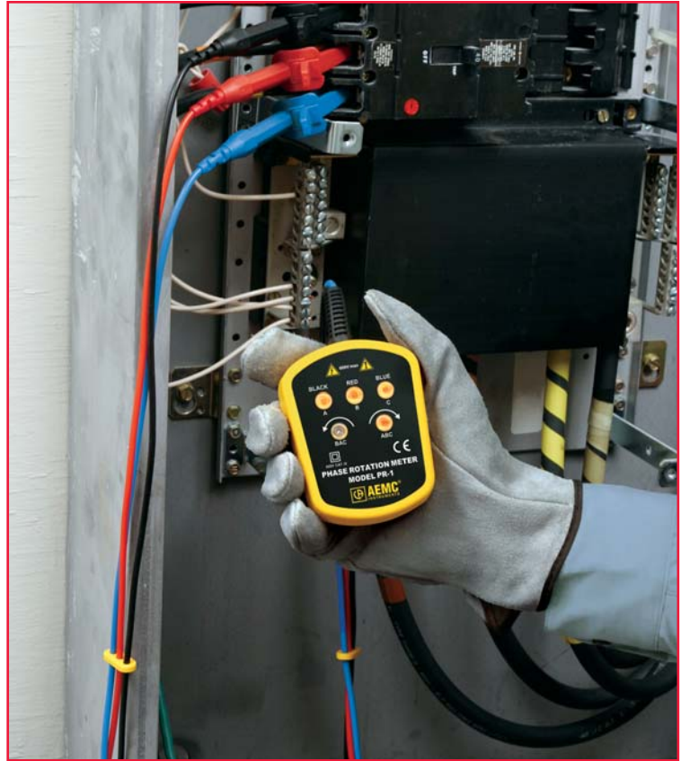
Model PR-1 quickly identifies proper phase sequence in an industrial panel