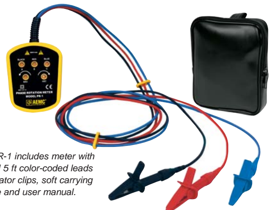
Model PR-1 includes meter with attached 5 ft color-coded leads and alligator clips, soft carrying case and user manual.