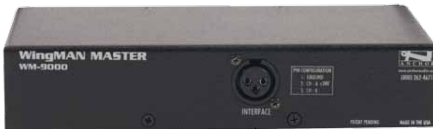
WIRED SYSTEM INTERFACE