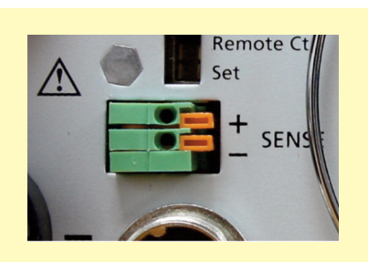
Remote Sense (Model 1900 only) Improve regulation of the power supply's output voltage at the load by using the remote sense terminals to compensate for voltage drop across load leads.

Use the included connector to wire up to an external variable DC voltage source or variable resistor to remotely control the power supply's output voltage and current or to turn the output on/off.