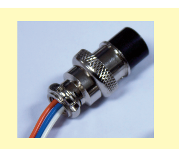
Analog Remote Control Capability

Quickly use common voltage and current settings with a flip of the Recall preset switch. Up to three different presets can be set and recalled.